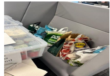
Donations given to Hamilton and district foodbank in September 2024