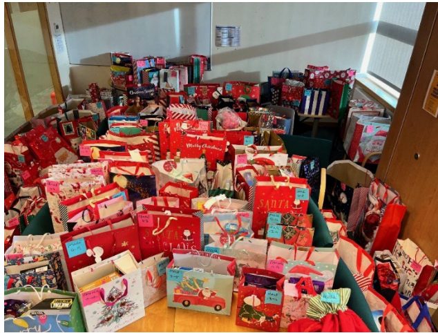
Donations made to Barnardo's – Christmas 2023